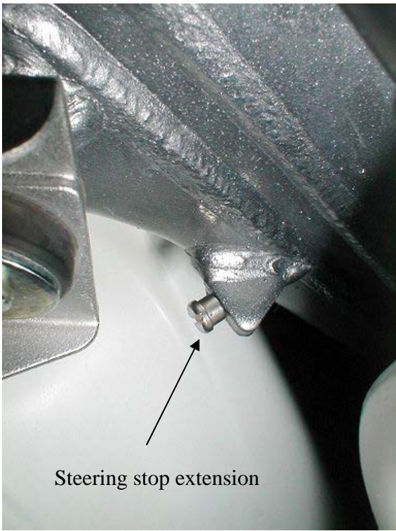
Steering stop extension