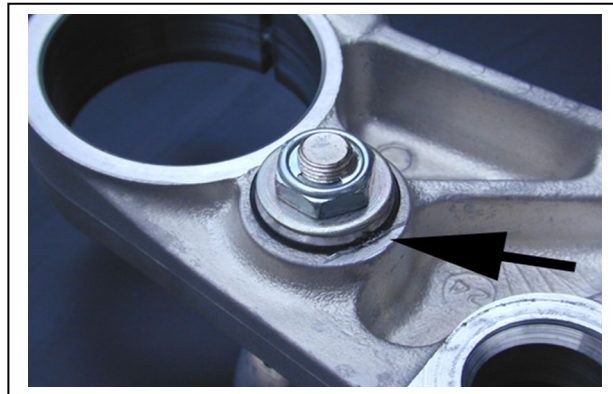
Photo at left shows the occasional mod required to some triple clamps in order to clear frame bracket.