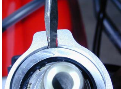
Remove bolt & spread gently to install