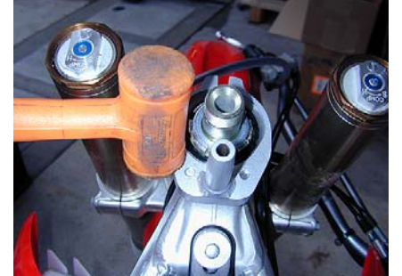
Tap bracket down until securely flush