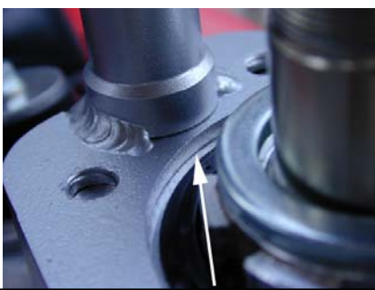
Be sure the frame bracket is all the way down flush with the head tube, all the way around the entire surface.