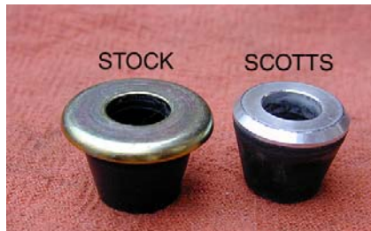
Our replacement cones go on the bottom