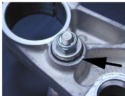
Only a few bikes need filing here.