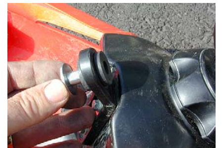
Flip the stock tank bushing over. Install it in from the bottom. Fender washer goes on the topside.