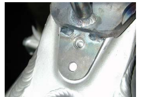
This shows hole alignment. Front hole is for the X model, the rear hole for the R model. The "Tapping & tightening" sequence insures proper alignment.