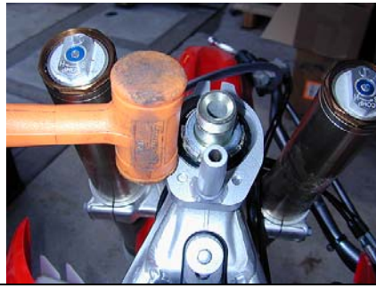
Tap bracket down until securely flush