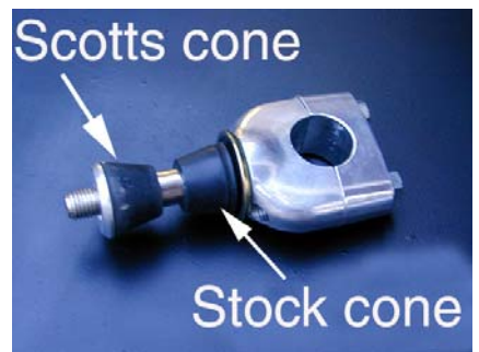
This shows the stock mounting perch