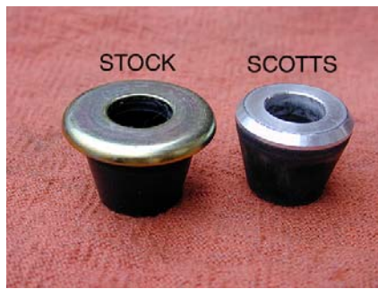
Use our optional replacement cones on the bottom in cases where clearance is an issue. Stock triple clamps don't need this.