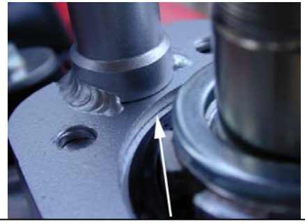
Be sure the frame bracket is all the way down flush with the head tube, all the way around the entire surface.