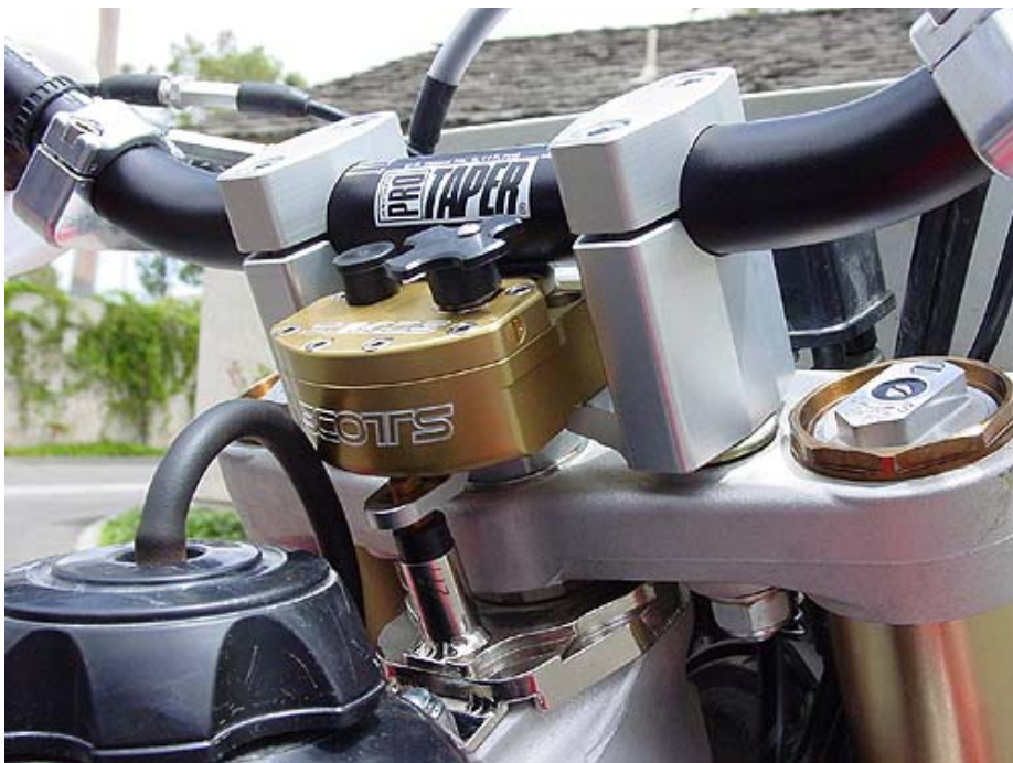
Finished SUB mount shown here on the CRF250X.