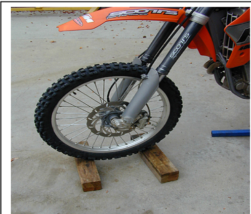
Block the front wheel & forks securely Use a tie down from axle to frame too.