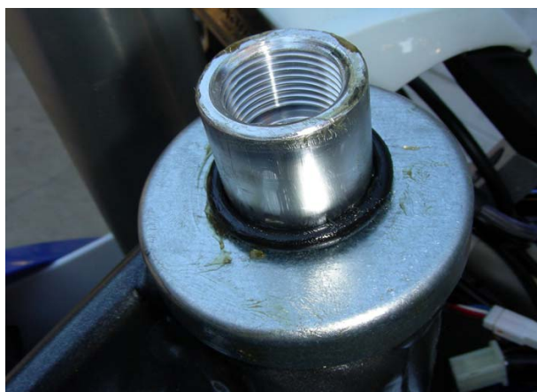
Replace the stock tin shroud with the new shroud