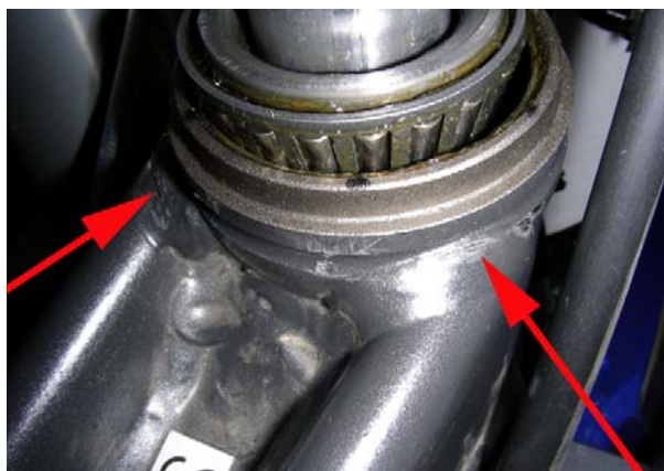
File any high spots that prevent the frame bracket from sitting down flush