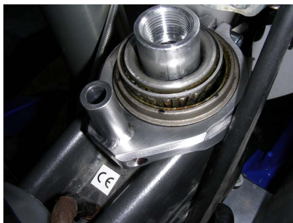
Use BLUE loc-tite (not red) on the set screws.