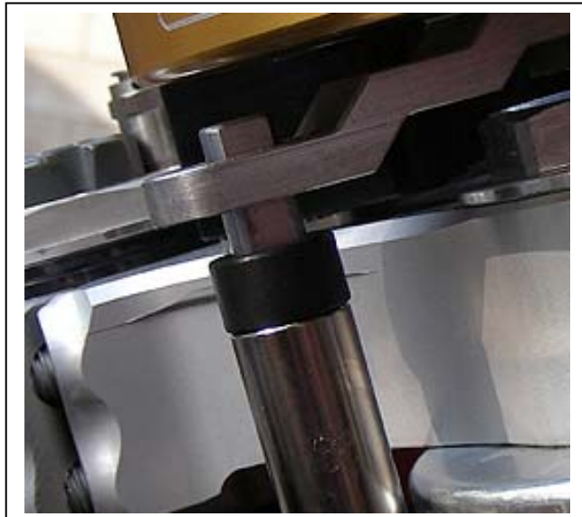
Correct tower pin height for this model