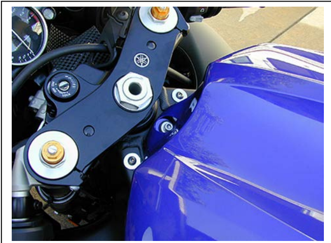
This photo shows the bike with the stabilizer kit removed and the holes plugged. We left them silver in the photo to show you how it looks, although the bolts and washers could be black to blend with the frame OR optional black plastic plugs like the ones Yamaha uses on the top of the triple clamp could be used as well.