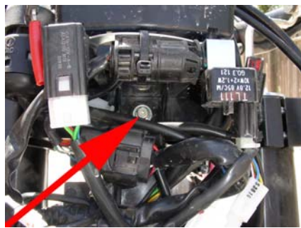
Remove this bolt next which holds the instruments to the triple clamp.