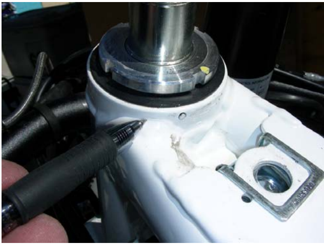
Each bike varies according to the factory welds. If the frame bracket does not seat flush, filing here on both sides may be required.