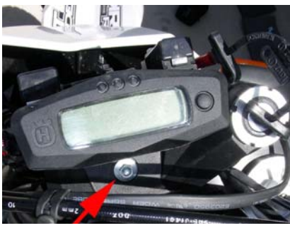
Remove this bolt which hold the front fender and headlight on.