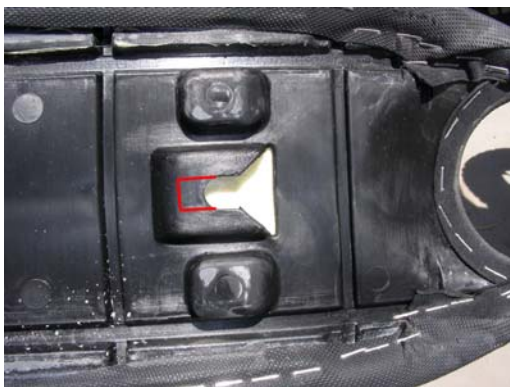
In rare cases, the seat base slot may need extending in order to facilitate easier seat installation to clear the frame bracket. Extend the slot where the red lines indicate.