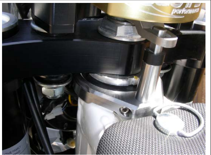
Frame bracket and seat installed.