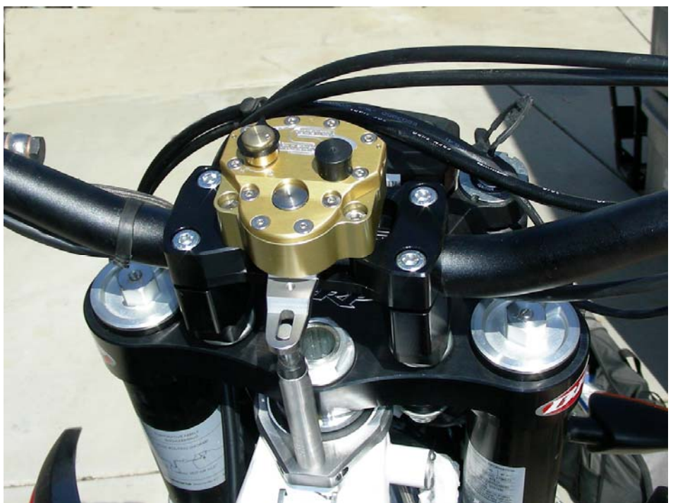
Shown here is the 449/511 Standard mount with Scotts/BRP triple clamp assembly.