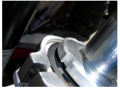
This shows the frame bracket NOT down flush with the head tube. File the welds until a flush mounting position is achieved.