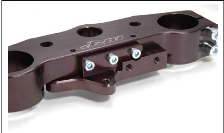
This shows the key and speedometer mount in place