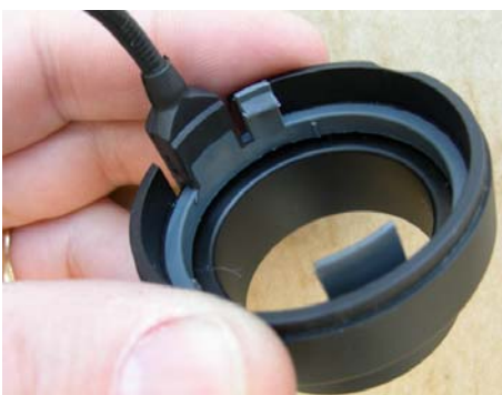
Install the security ring into the underside of the new key cover.