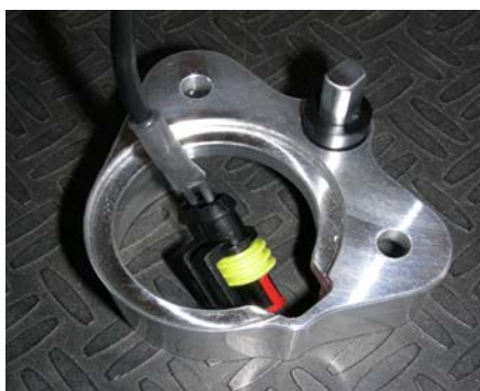
Route the wire through the aluminum housing before snapping cover on.