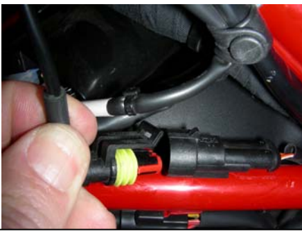
Unplug the security ring wire which is on the left side of the frame.