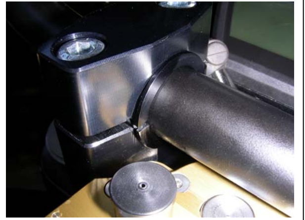
At left is the finished kit installed correctly.