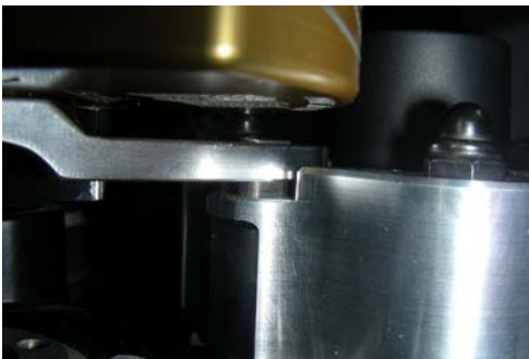
This shows the correct tower pin height