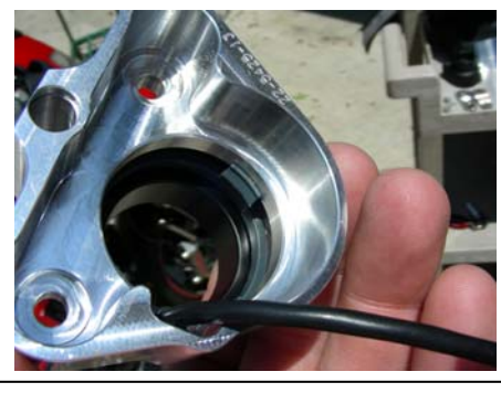
Guide the gray tabs inside and snap the black cover into the aluminum housing.