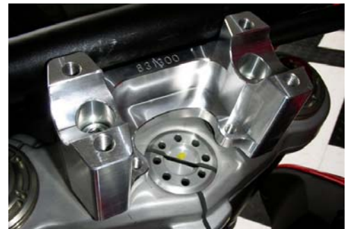
This shows the SUB mount only installed