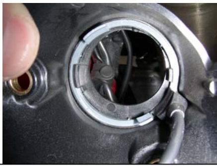
Carefully pull the black tabs back to release the security ring