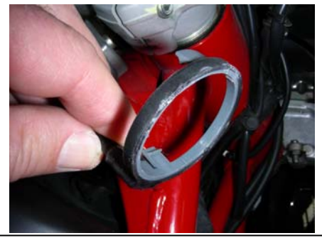
This shows the security ring removed from the stock housing. Remove glue.