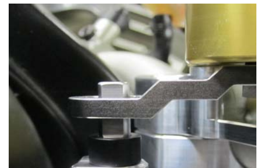
This shows the correct tower pin height