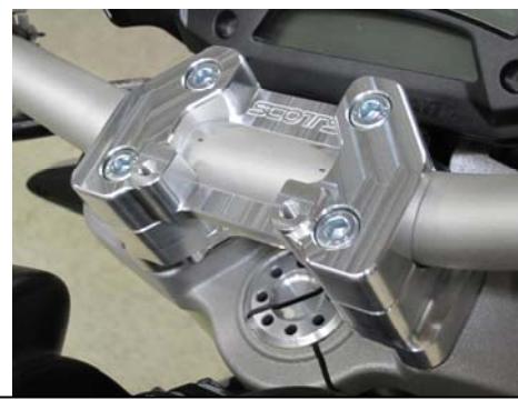
New bar mounts installed