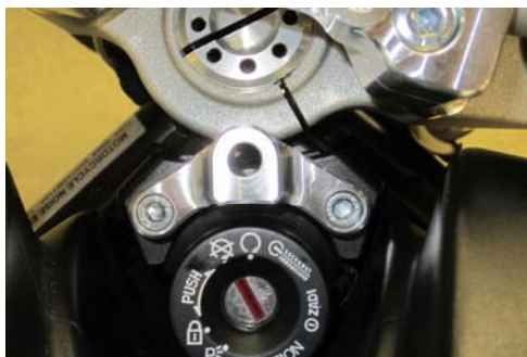
Bolt the frame bracket to the stock key