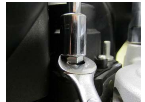
Remove the studs using 2 wrenches