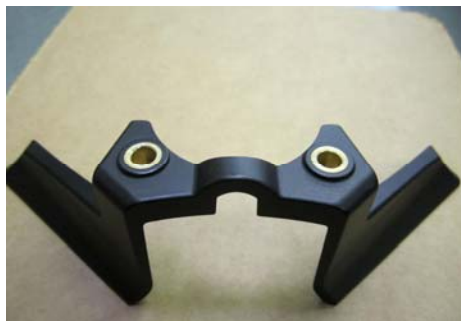
Cosmetic key cover you removed