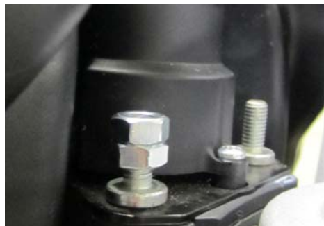
Double nut the key studs to be removed