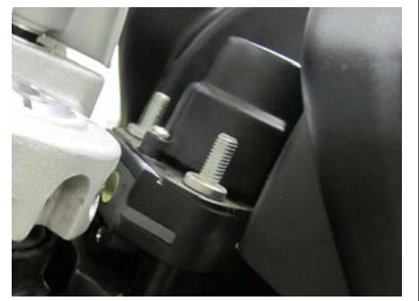
Remove the cosmetic key cover