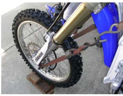
Block the front wheel securely!