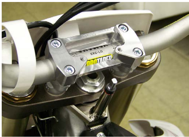
Install the triple clamp / tighten the main nut and fork pinch bolts to factory specs. Then install the bars and upper Barclamp and tighten the (4) bolts evenly that hold the bars tight. Check the tension on the head tube bearing by turning the bars left to right. Finally, tighten the tank bolt.