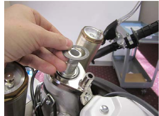
Install the thin thrust washer over the stem and under the triple clamp. Airbox bolt not tight yet.