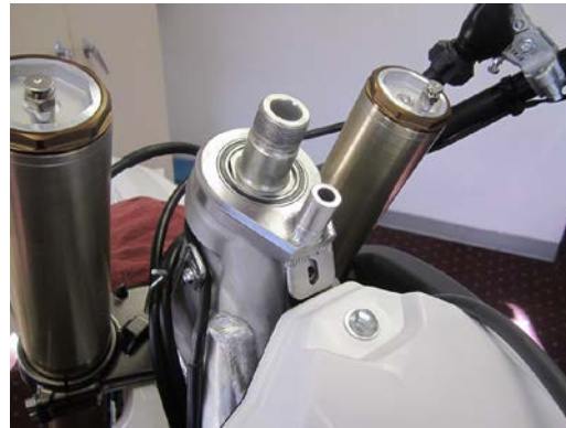
Slide the frame bracket over the special nut with airbox tab aligned. Do not tighten yet.