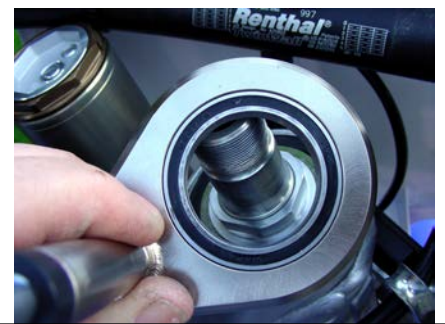
Install the frame bracket and bearing over the new special nut.