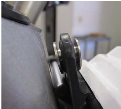
Remove the Air box bushing and install the two new ones provided, one in from each side.