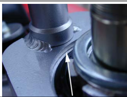
Be sure the frame bracket is all the way down flush with the head tube, all the way around the entire surface .