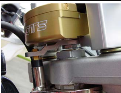
Shows correct tower pin height