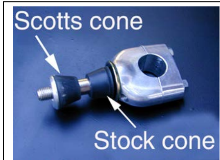
This shows the stock mounting perch assm.