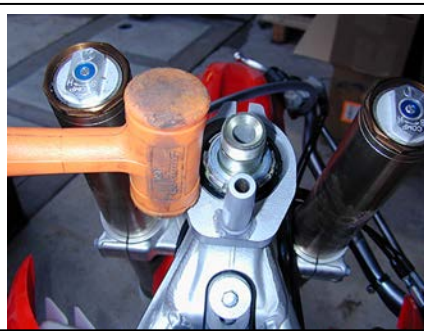
Tap bracket down until securely flush