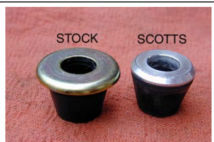
Use our replacement cone on the bottom