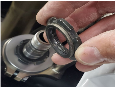
Install the second castle nut and washer in between, this is the lock nut, or jam nut.