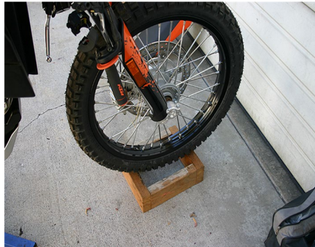
Blocking both front and rear wheels is a good idea to prevent "roll-aways" once the triple clamp is removed