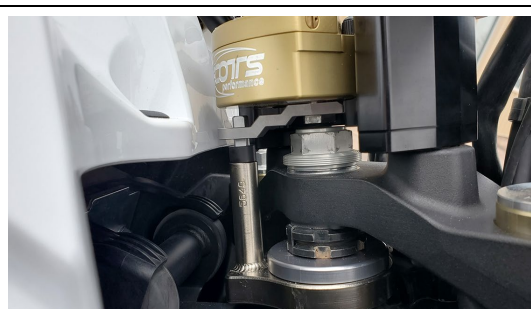
Finished kit with linkarm and tower pin properly aligned.