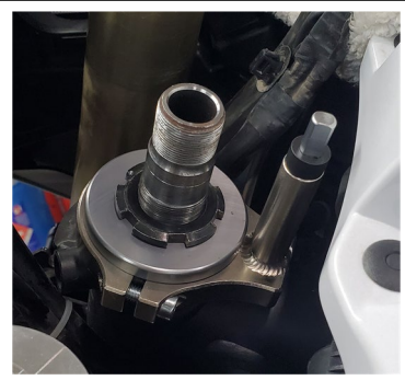
Install the first castle nut to the tension it was before coming off. This nut adjusts the tension on the head bearing. See factory specs.