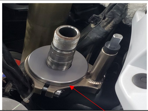
Install the newly supplied bearing shroud and be sure it's not touching the frame bracket