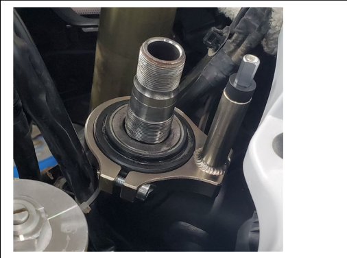
Frame bracket installed and sitting below top of head tube so shroud does not touch