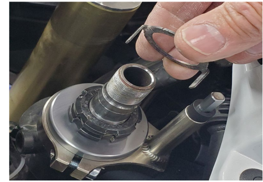
Install the tab so it fills both sets of slots on the castle nuts