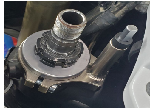
Tighten nut #2 against the first nut and align the castle nuts so the slots match allowing the tab to drop into the slots.