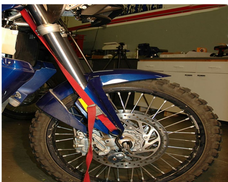
It's critical to tie the forks up to the rafters, as when the triple clamp is off, the forks can roll away from the bike.